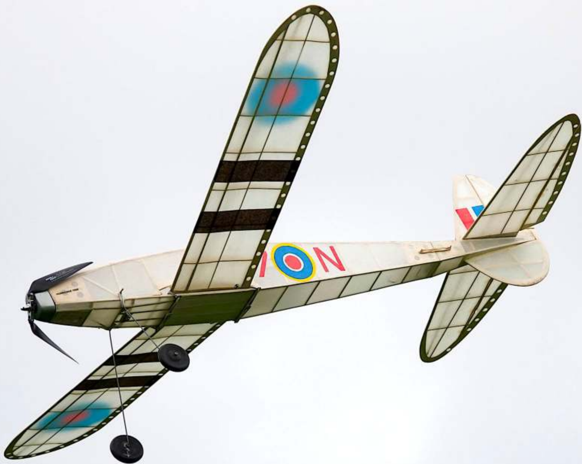
Hurricane Trevor Glogau