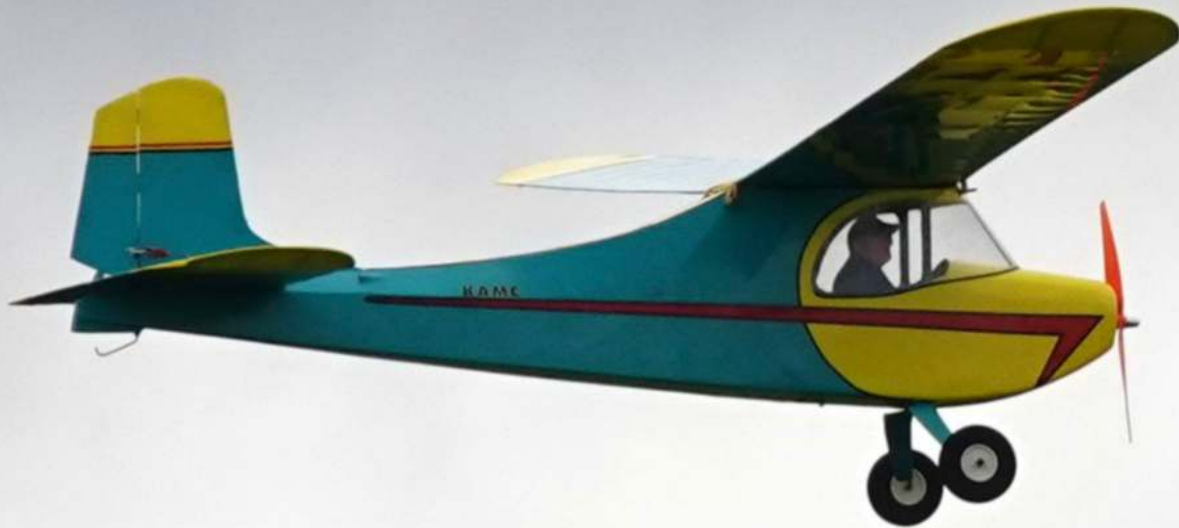
Deacon Ian Crossland